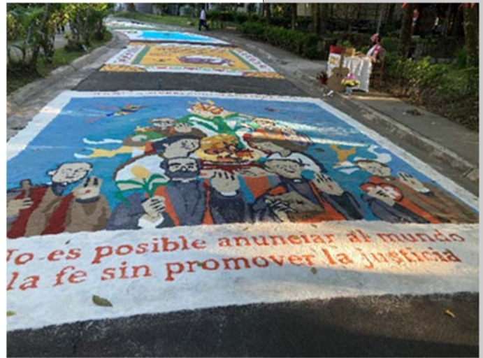
The alfombras at the University of Central America (made of salt or sand earlier that day!)