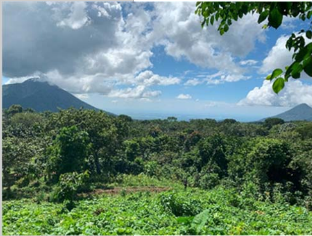
View of the countryside from Finca La Leona