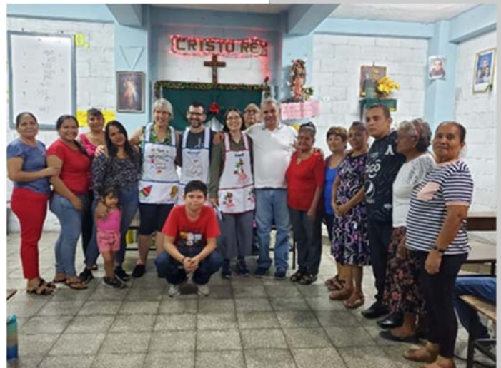
Welcome reception at the Cristo Rey Chapel