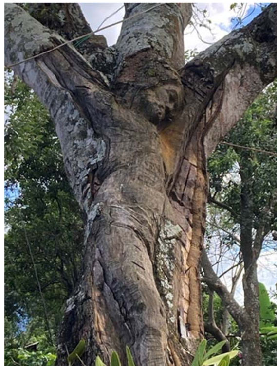
Image of Christ carved into a tree at Finca La Leona

Overall, it was a wonderful experience, and we cannot recommend it enough. The overarching question after any trip like this is, of course, "what now?" For us, the answer